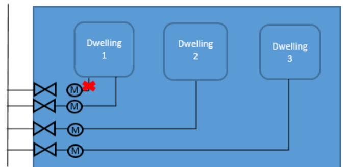
4. Multiple meters - two meters to one dwelling (not acceptable)