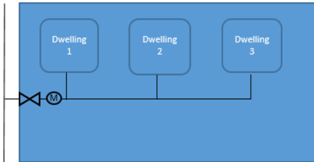
1. Single council meter (acceptable) to multiple units within the same property

Please refer to figure 1 below for potential scenarios.