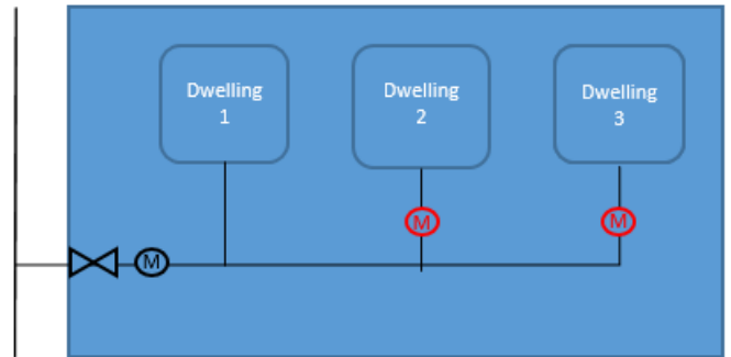
3. Multiple meters inline within the same property - double metering (not acceptable), however, Single council meter and private (owner's) meters are acceptable