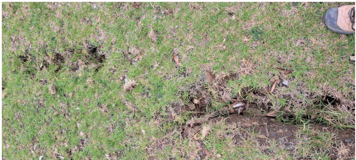
Figure 3: Barrington Tops Forest Road – Cracks along roadside at Chainage 7250