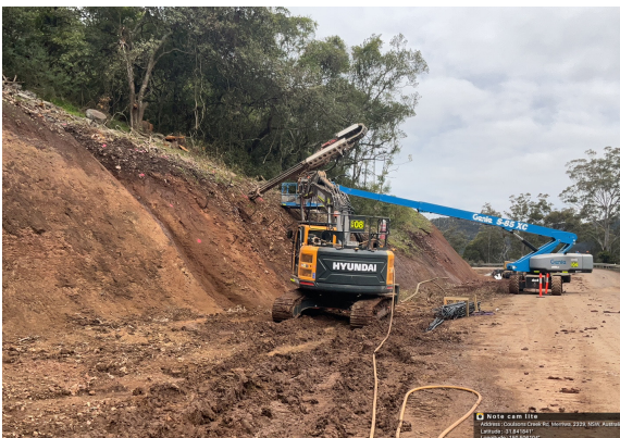
Rock Bolt Drilling