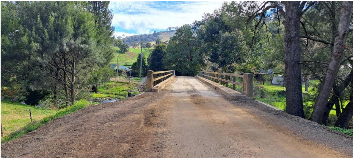
Figure 2: Moonan Brook Road – Finished pavement and clear vision at bridge approach looking East