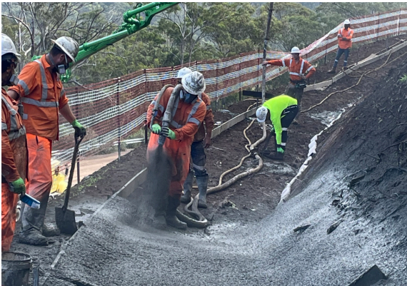
Catch Drain Shotcrete