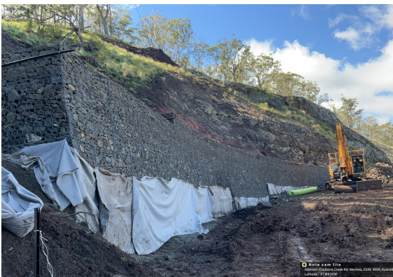
Gabion Wall Construction