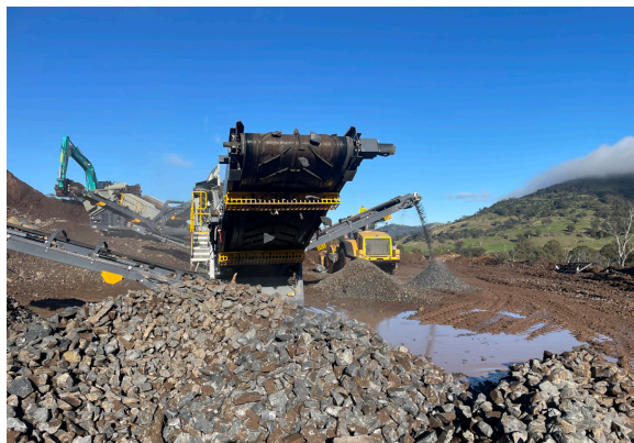
Manufacture Gabion Rock at TSR