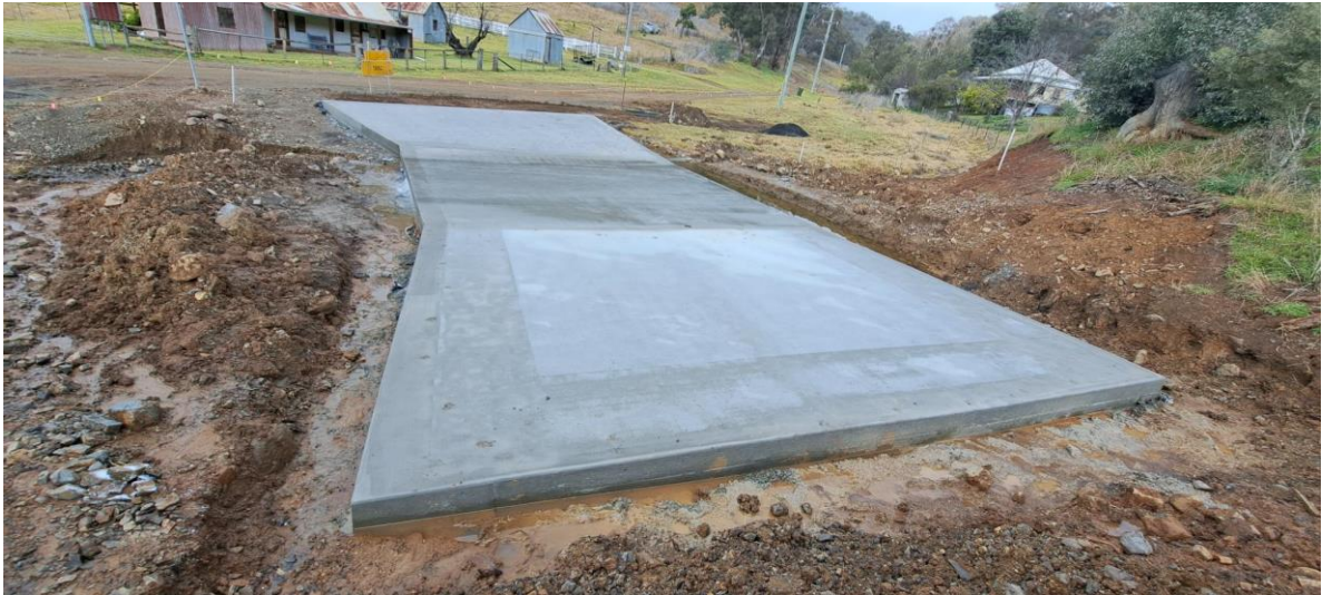
Figure 1: Concrete causeway on Moonan Brook Road near Blue Mountains Creek Road