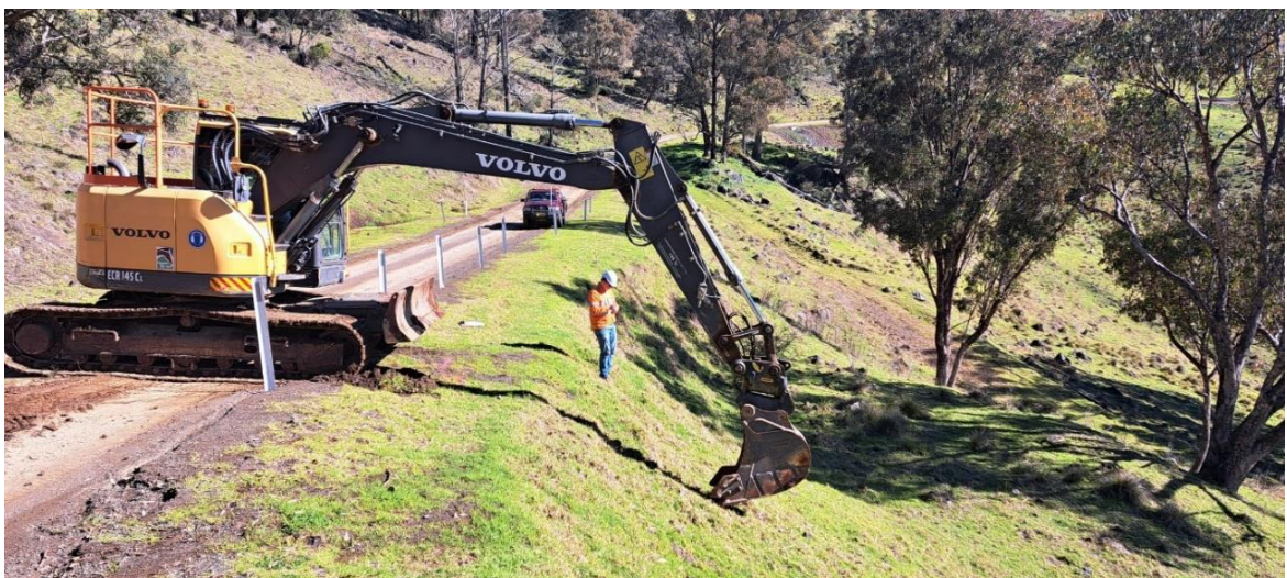
Figure 4: Barrington Tops Forest Road – Excavator digging trench with geotechnical engineer at Chainage 7250